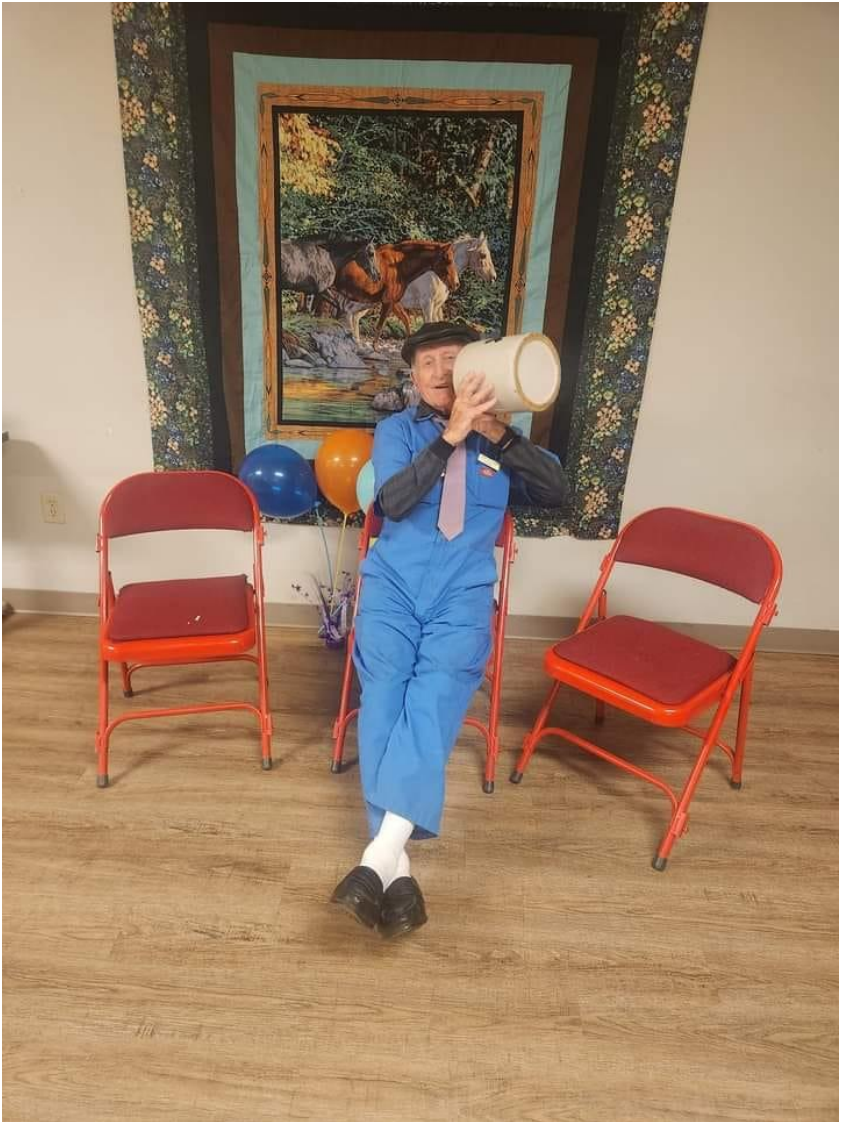
Next, several pictures from the Maverick Mixers Sep. 28 dance.