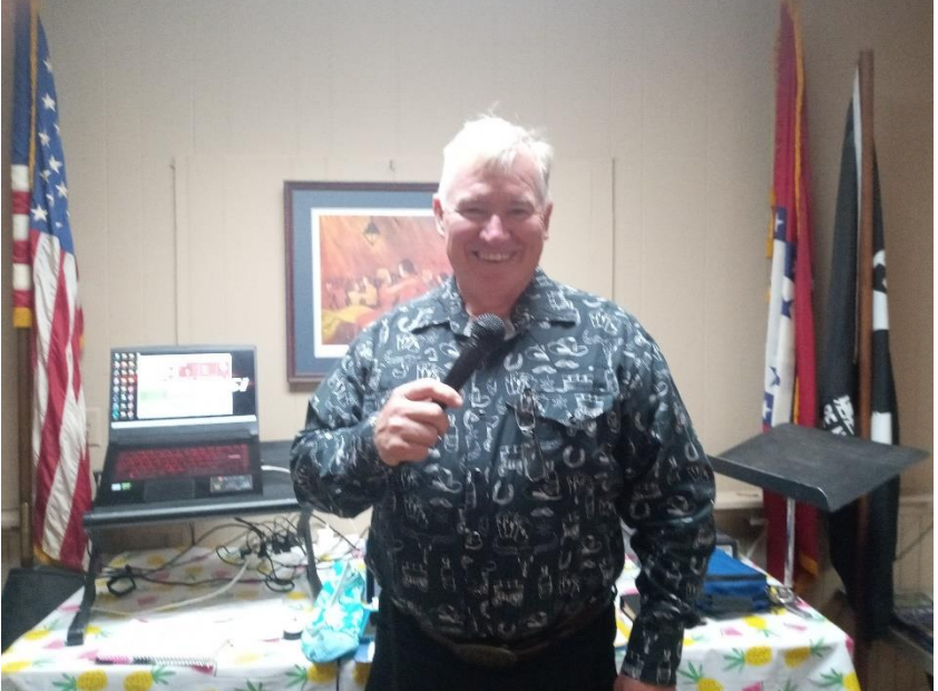
Next, several pictures from the Twirling Lariats Sep. 20 dance.