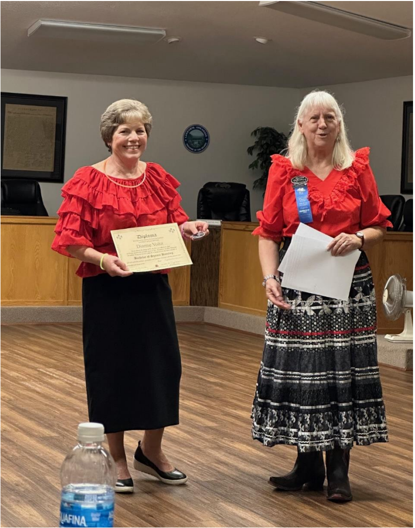
Next, several photos from the Heber Springs Sep. 27 Hillbilly Dance.