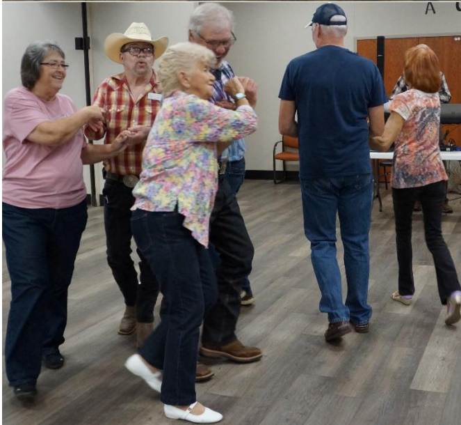
Next, five photos from the Twirling Funtimers Glo Graduation.