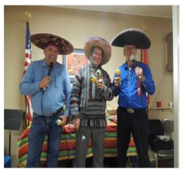
The Amigos Three In 23 Saturday, Jan. 7, 2023 - 7pm to 10pm - $10 per person

American Legion Post 128, 9925 Leah Lane (Mann Road and Leah Lane), Mabelvale, Arkansas