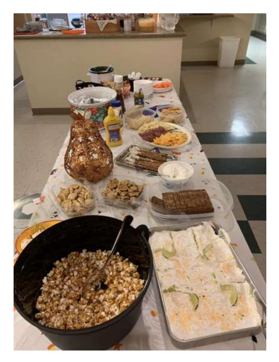
No tricks, but plenty of treats with the duty square !!