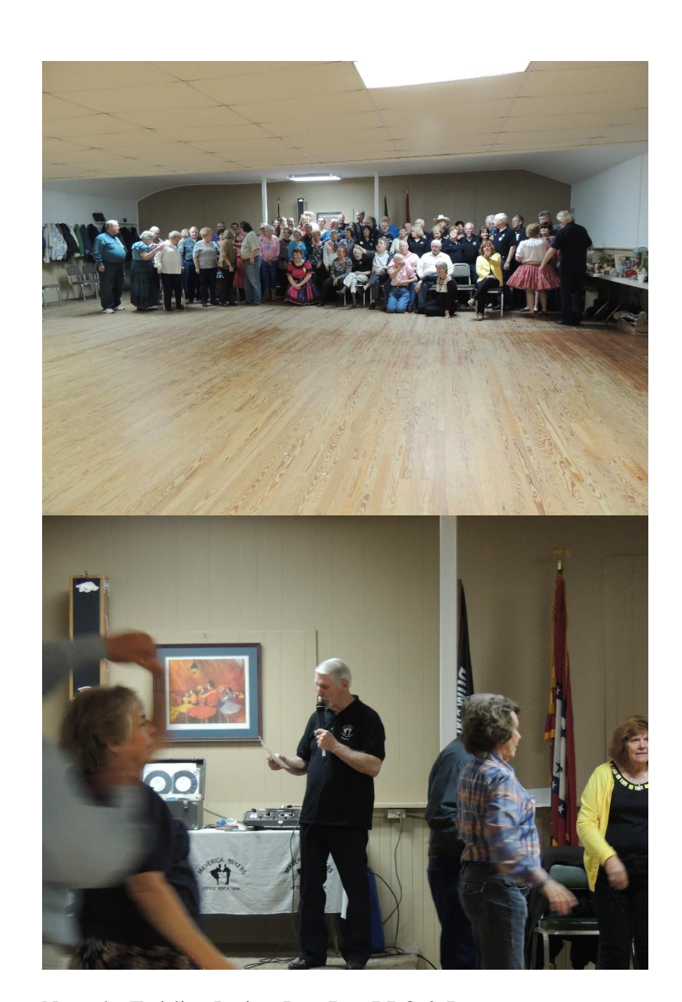
Next, the Twirling Lariats June Bug BBQ & Dance: