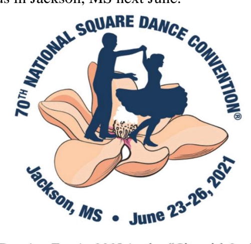
Dancing Fun in 2021 in the "City with Soul"

Several dancers from Arkansas are serving as volunteers, and hope you can join us in Jackson, MS next June.