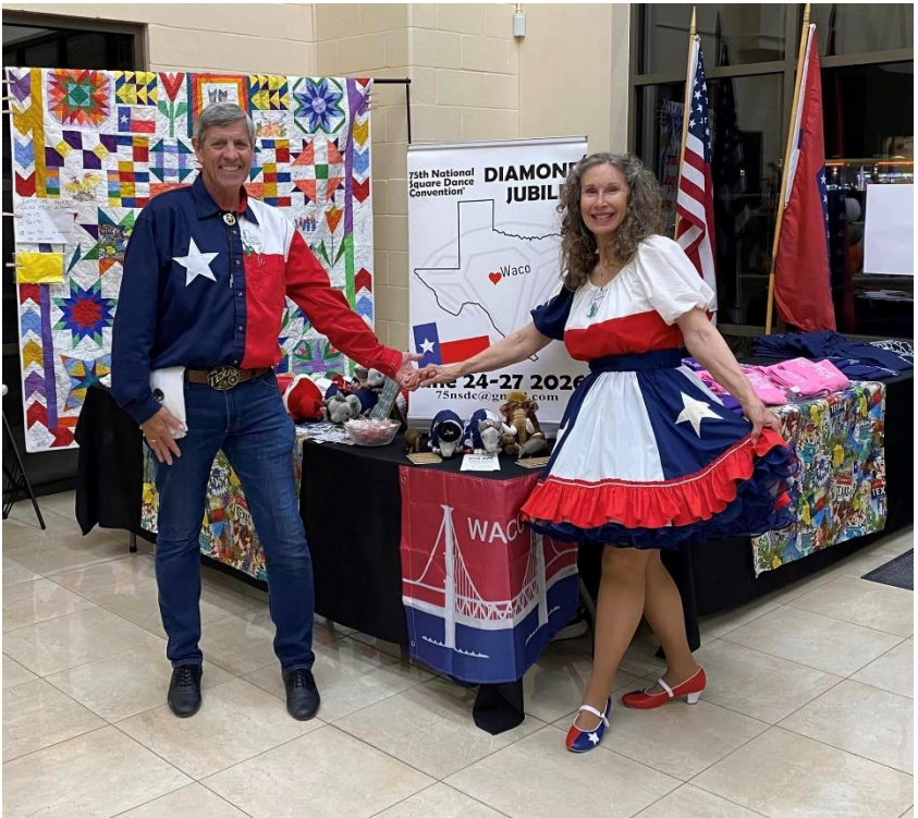
Folks from the 74 th NSDC in Shreveport, and the 75 th NSDC in Waco, were taking registrations from dancers in attendance at the weekend.