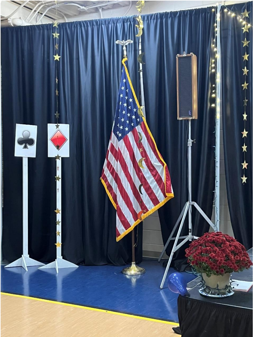
Square Dancing is the official dance of the USA, and of Arkansas.