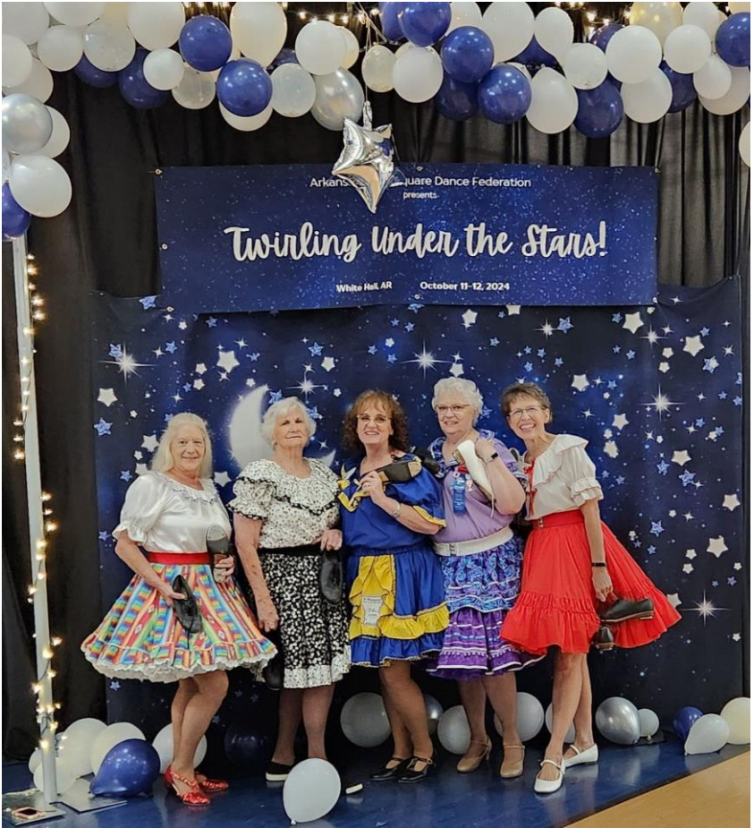
Some of the Arky Cloggers at the 2024 ASSDF Fall Festival.